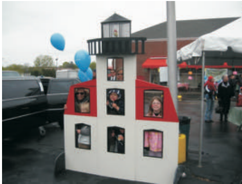
Children using the cut out model of the Lighthouse

The Friends of Pomham Rocks Lighthouse is a member of the East Providence Chamber of Commerce. As a member, we participated in the annual Touch-A-Truck Day. Rob Charbonneau brought his boat over for the children to touch and we brought the cut out model of the lighthouse for them to have their pictures taken.