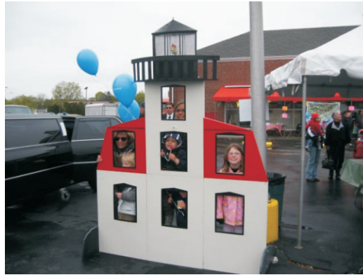
Children using the cut out model of the Lighthouse

The Friends of Pomham Rocks Lighthouse is a member of the East Providence Chamber of Commerce. As a member, we participated in the annual Touch-A-Truck Day. Rob Charbonneau brought his boat over for the children to touch and we brought the cut out model of the lighthouse for them to have their pictures taken.