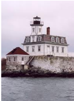
Rose Island Light, Narragansett Bay, Newport, RI