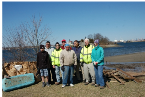
The crew & debris from the Clean-Up