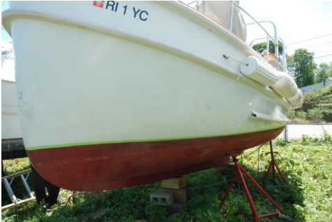
The Lady Pomham with a freshly painted hull

Everyone had a good time and the event committee received many positive reviews from attendees.