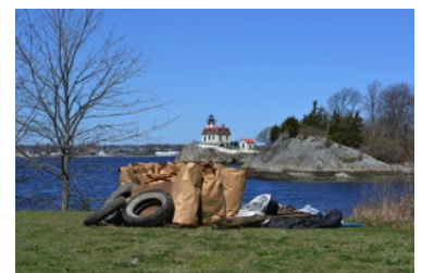
The debris collected at the Annual Clean Up