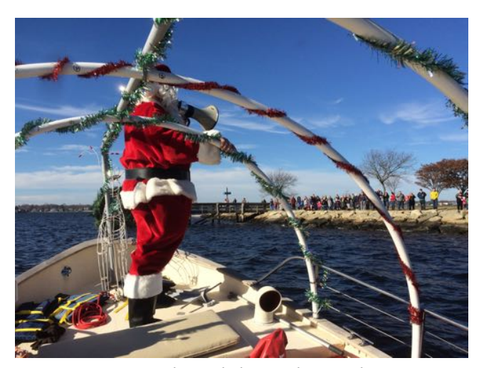
Santa onboard the Lady Pomham

Santa circled around the park a couple of times as the children and their parents cheered and waved. The weather was far more cooperative than in years past which allowed the boat to continue to the lighthouse for Santa to hang the wreath on the Oil House.