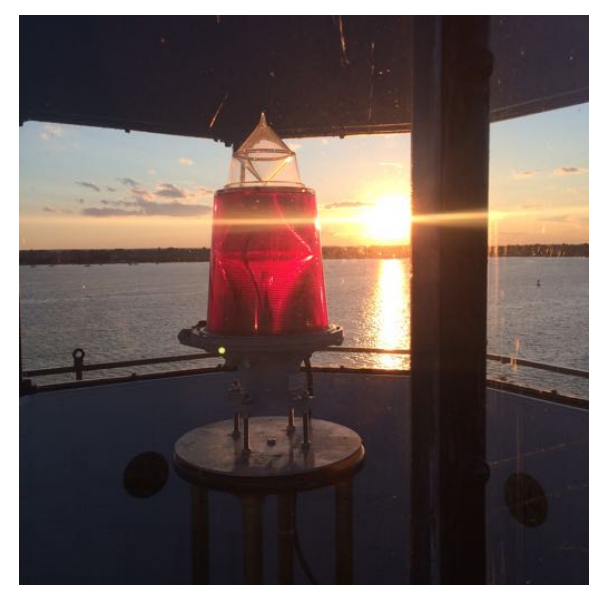
Pomham Rocks at Sunset

Raffle tickets can be obtained by sending a check, made payable to Friends of Pomham Rocks Lighthouse, to Friends of Pomham Rocks Lighthouse, c/o 81 Harris Street, Riverside, RI 02915. Include your name, address and phone number on your check. Call 401-433-3463 with any questions.