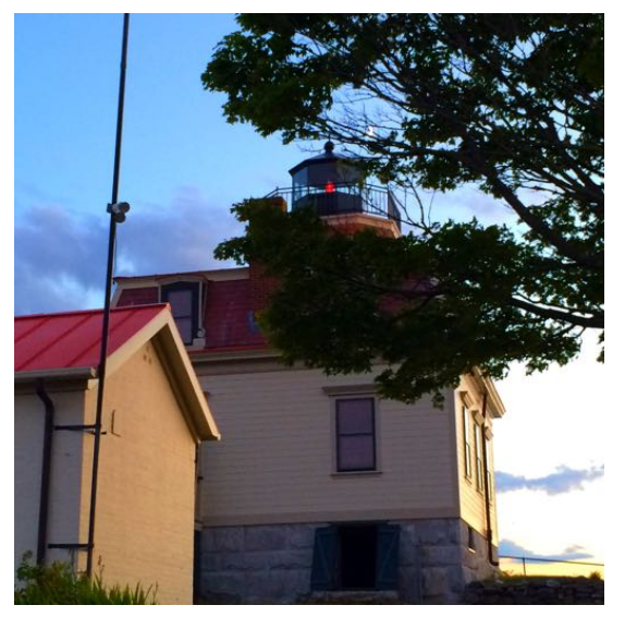
Pomham Rocks at Moonlight