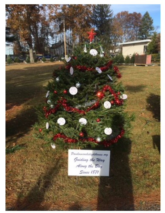
Our Lighthouse Tree

Pomham Rocks Lighthouse once again participated in the Winterfest display at the Senior Center in East Providence. The same ornaments Jean made were used from last year, in addition to red and silver balls. We hope all who came out in the cold weather in December enjoyed our tree.