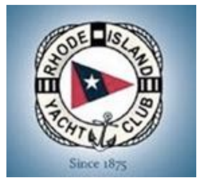
Thank you for hosting us RIYC

The Annual Meeting was a chance to celebrate the many accomplishments achieved by dedicated members of our organization and enjoy each other's friendship while viewing our lighthouse from the Rhode Island Yacht Club, our across-the-river neighbor.