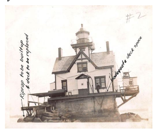
Bullocks Point Lighthouse c. 1920s

We are hoping to preserve the history of these other Providence River Lighthouses that are no longer standing. If you have pictures of either of these lighthouses and would like to donate them please send them or a copy to, P.O. Box 15121 Riverside, RI 02915, or they can be emailed to history@pomhamrockslighthouse.org Thank you!