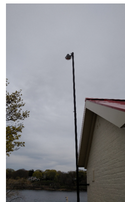
New LED yard light on Oil House