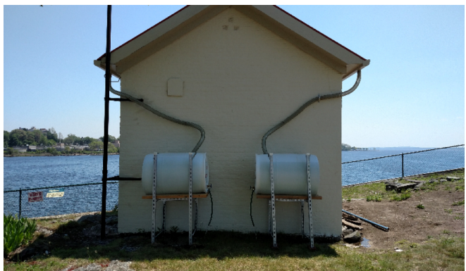
Water storage on Oil House