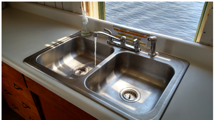
Running water coming from new sink