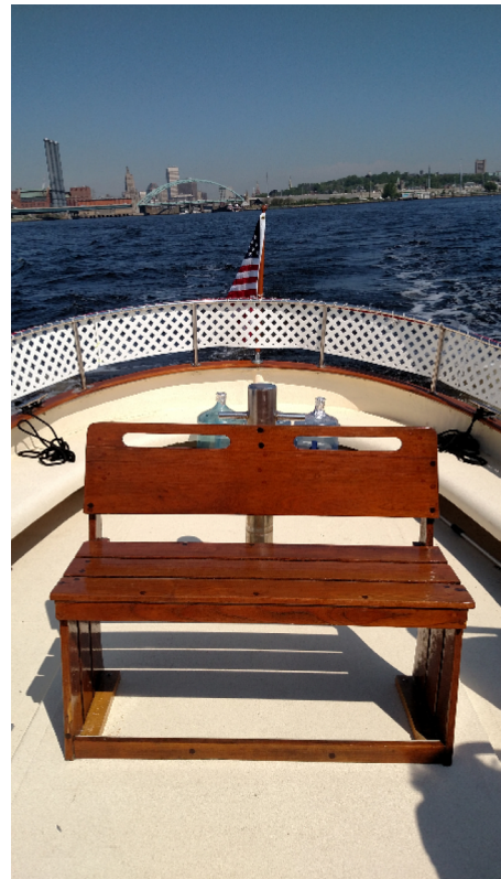
New bench on the Lady Pomham

Our smaller “red” boat is ready and will be featured in the Riverside Memorial Day parade as a “Friends of Pomham Rocks” float. Our launch was taken out of its winter storage location on land and re-floated April 13 th . Basic maintenance was performed on the launch mechanical systems, and as of this writing, has already made seven trips to the lighthouse this season to support the ongoing installations and maintenance Pomham Rocks personnel are performing. A salvaged teak marine seat was refinished and installed in the launch as well. The seat and refinishing was of no cost to the lighthouse.