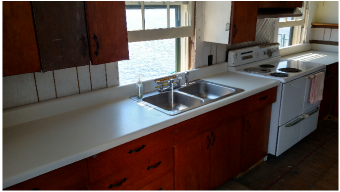
Cleaned Kitchen Counters

Other work done includes the installation of a new solar system powered photocell controlled LED yard light that lights the east end of the island at night. Additionally, “shore power” electricity was installed via underground conduit to the Oil house from the main building and a temporary rain water Oil House roof collection system installed to be ready for contractor use once a contractor commences with renovation. The collection system was fabricated from donated materials and was no cost to the lighthouse.