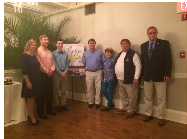
Some of the Friends of Pomham Rocks Lighthouse that were at the banquet