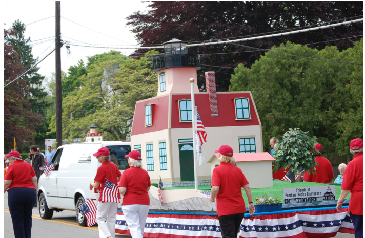
Memorial Day 2009