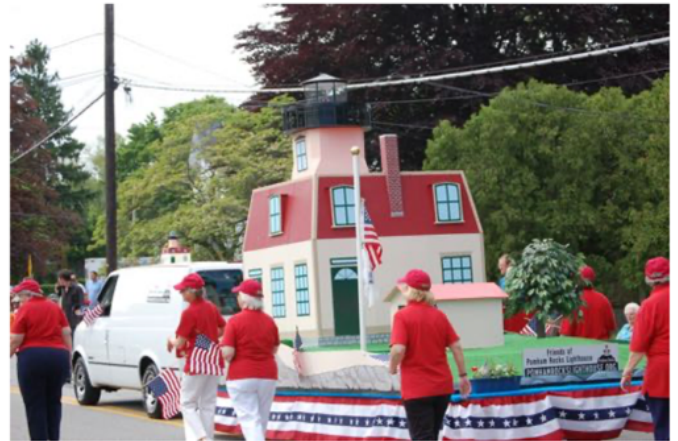
Memorial Day 2009

will begin at 10:00a.m. from the Carousel in Riverside. The parade usually lasts about an hour, and we would recommend showing up at least half an hour early to get organized.