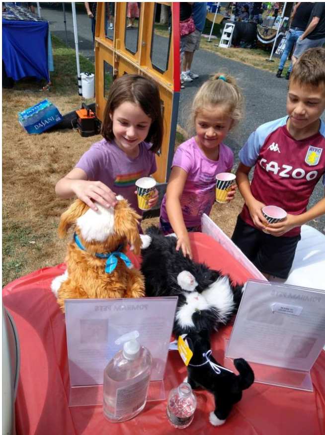
Enjoying the Pomham booth at the Looff