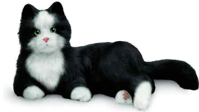
Tommy the Cat