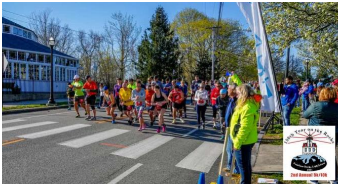
Start of the Race

Tommy, our famous Lighthouse Cat, as well as a supply of Swedish fish, representing our feline hero's favorite treat from the Bay! Plans are now underway for our Third Annual Lighthouse Run in 2023, tentatively scheduled for April 22. Stay tuned!