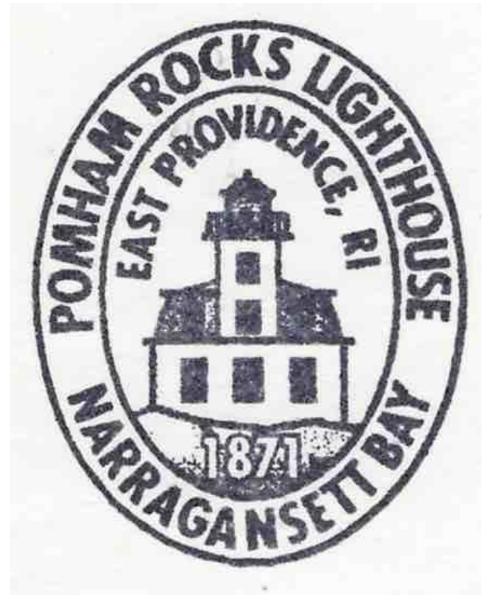
Pomham Rocks Stamp

If you have been to Pomham Rocks Lighthouse and would like to remember the visit with one or both stamps, send a check for a minimum donation of $2 per stamp, made payable to Friends of Pomham Rocks Lighthouse, and a self-addressed, stamped envelope to P.O. Box 15121, Riverside, RI 02915. If you would like to purchase a Lighthouse Passport, the cost is $15. Tour participants who visit Pomham Rocks Lighthouse can purchase the passport or stamps in the gift shop following their tour.