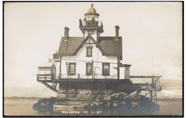
Figure 1: Bullocks Point Lighthouse

They were all built in the 1870's and were set along the riverfront of a neighborhood called Cedar Grove, which was later named Riverside.