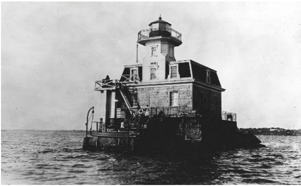
Figure 3: Sabin Point Lighthouse

During the 1800's, thousands of sailing ships, barges, steamships, fishing boats, canoes and other watercraft cruised up and down the River, bringing supplies from the seas and farms and goods from all over the world to the busy Port of Providence, and carrying passengers to Newport, Fall River, and New York City.