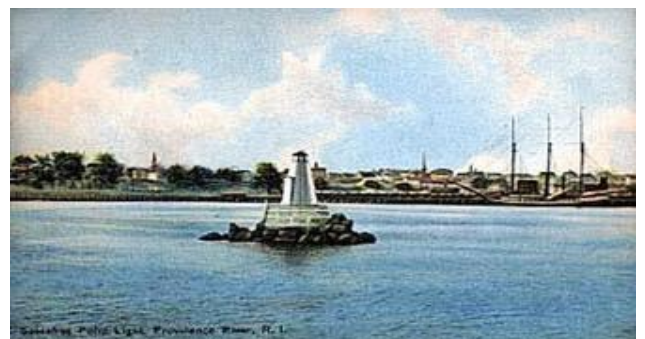
Figure 5: Sassafras Point Lighthouse

When the Bullocks Point light gleamed, it could be seen by Sabin Point, and when Pomham Rocks sounded its horn, it could easily be heard by Fuller Rock, and so on up and down the line. These were true Sister Lighthouses who illuminated dark nights and who sounded their bells and horns both day and night. What was it like to be a lighthouse in those days?