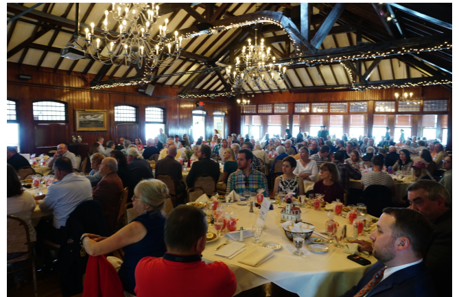
Over 200 guests enjoyed the formal atmosphere at the Squantum Association