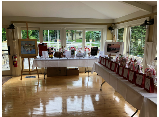
An array of silent auction and raffle items for guests to win