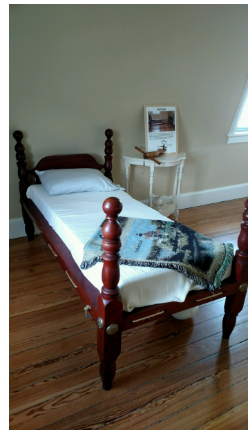
Sabin Point Exhibit