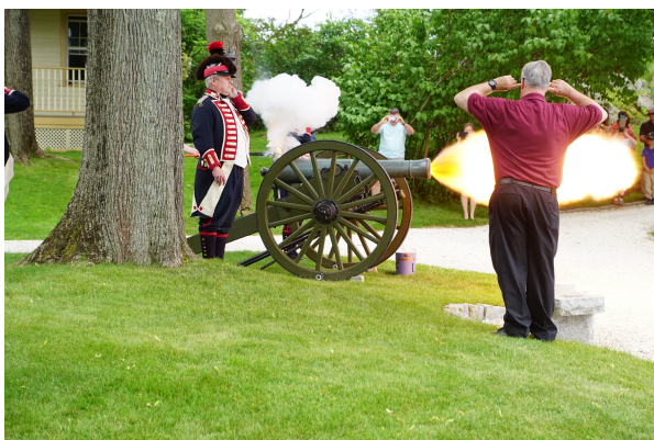
The Cannon echoed across the bay signaling the start of tours for the event