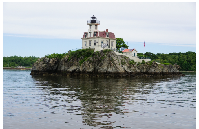
The Lighthouse proudly greeted each visitor as they arrived at the island