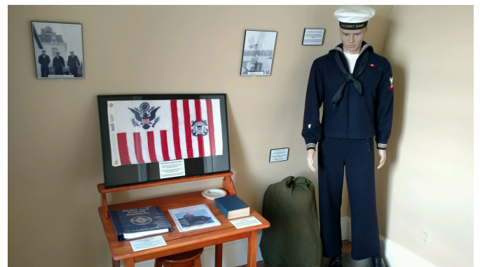
Coast Guard Era Exhibit