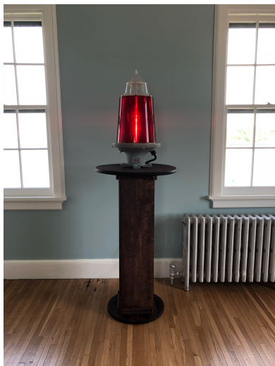
Pomham Rocks Exhibit