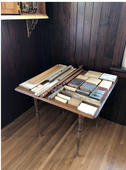
Rotating Exhibit Room