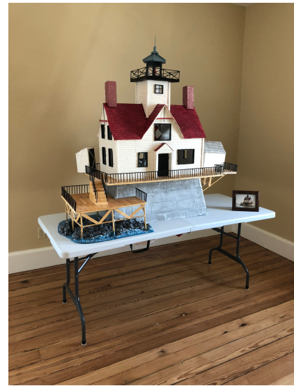
Bullocks Point Lighthouse Exhibit