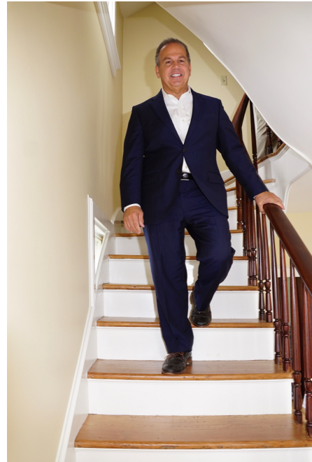
U.S. Congressman David Ciciliine descends the newly restored staircase inside the lighthouse