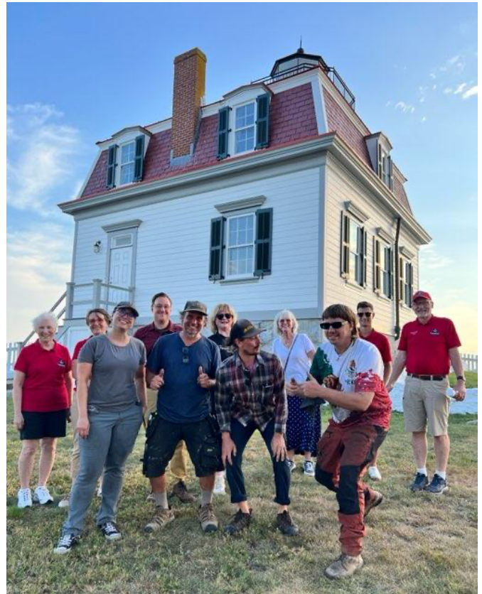
Group photo in front of the lighthouse

art of using reclaimed materials to educate future generations, restoration and preservation of Pomham Rocks Lighthouse serves to reclaim the maritime history of the past.