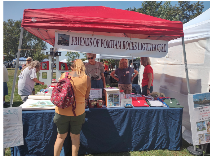
FPRL booth at the Looft