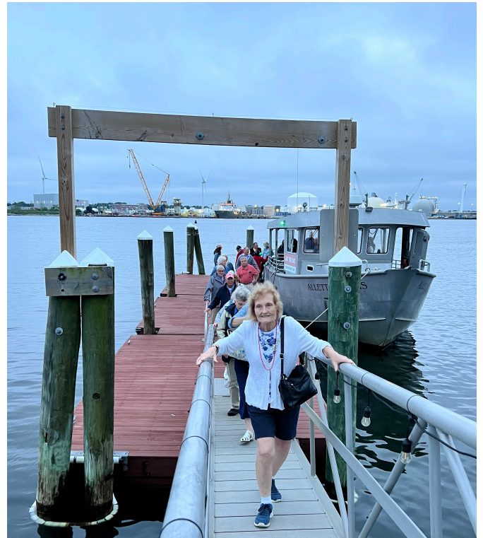
Guests returning from their tour