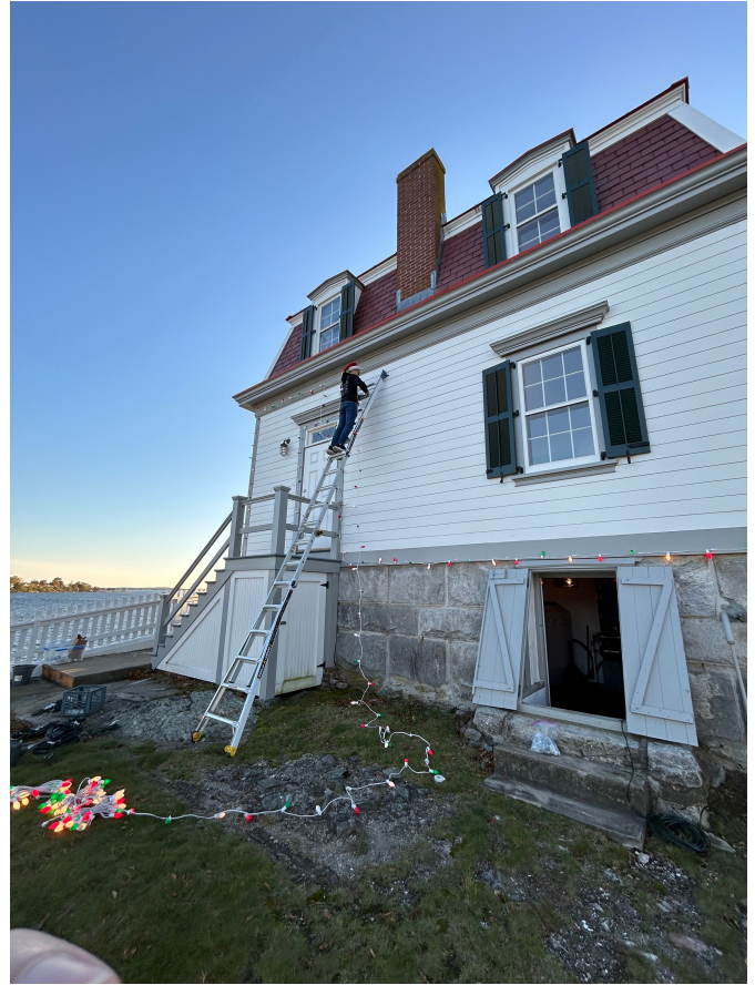
Hanging up the lights

Even the flagpole was trimmed with lights. The white picket fence surrounding the half-acre island glowed in a rainbow of colors. Local residents were able to view the holiday lighting each night from 4:00 PM to 11 PM from November 22 nd through December 27 th .