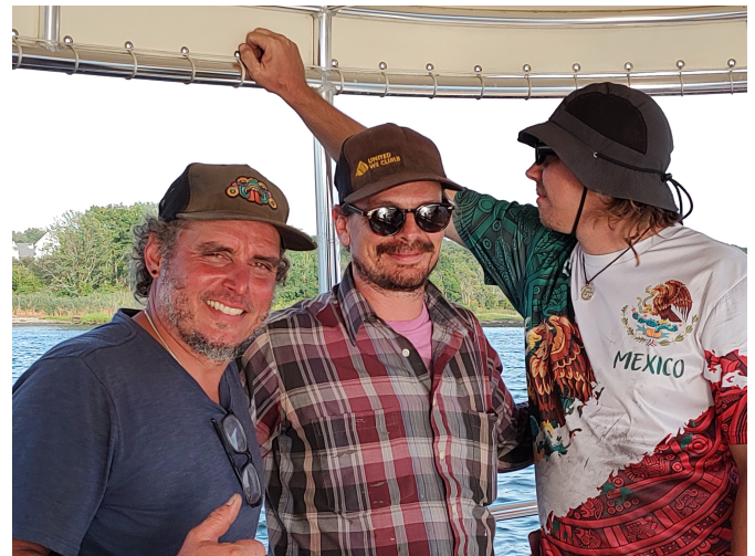
Troll Group heading to the Lighthouse